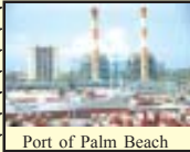
Port of Palm Beach

Found amidst a major metropolitan area and the scenic Lake Worth Inlet is the Port of Palm Beach in Riviera Beach . With over 200 acres of land complete with behemoth cargo ships and signature smoke stacks, this Port is the fourth busiest container port in Florida and among the top 20 in the United States. With three slips and four wharves bordering the water, the Port also sports a multi-level terminal with a VIP Lounge and other amenities for upscale cruising, along with the capacity to handle two vessels carrying some 1, 200 passengers each. The facility is also the only in South Florida using a pier-side box rail system, that operates 24 hours a day, making it a truly awesome place for filming the essence of a factory. It was the site for a variety of film shoots including Shut Up and Kiss Me in 2004 featuring a heart-pounding scene where a car drove into the Intracoastal Waterway, and the Port was invaded by pirates, when Walt Disney Productions used Tropical Shipping to transport cargo to the Caribbean during the filming of the sequels to Pirates of the Caribbean . For more info please call 561.233.1000 or visit www.portofpalmbeach.com .