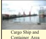
Cargo Ship and Container Area

Found amidst a major metropolitan area and the scenic Lake Worth Inlet is the Port of Palm Beach in Riviera Beach . With over 200 acres of land complete with behemoth cargo ships and signature smoke stacks, this Port is the fourth busiest container port in Florida and among the top 20 in the United States. With three slips and four wharves bordering the water, the Port also sports a multi-level terminal with a VIP Lounge and other amenities for upscale cruising, along with the capacity to handle two vessels carrying some 1, 200 passengers each. The facility is also the only in South Florida using a pier-side box rail system, that operates 24 hours a day, making it a truly awesome place for filming the essence of a factory. It was the site for a variety of film shoots including Shut Up and Kiss Me in 2004 featuring a heart-pounding scene where a car drove into the Intracoastal Waterway, and the Port was invaded by pirates, when Walt Disney Productions used Tropical Shipping to transport cargo to the Caribbean during the filming of the sequels to Pirates of the Caribbean . For more info please call 561.233.1000 or visit www.portofpalmbeach.com .