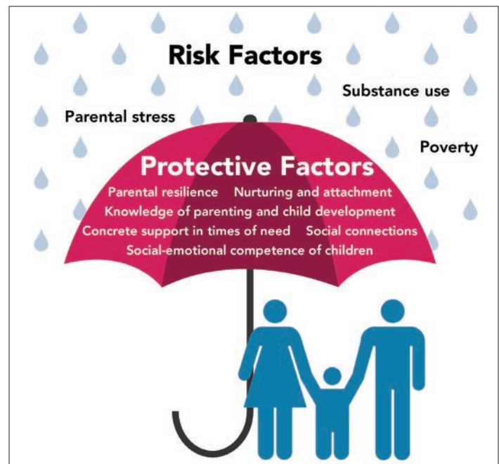
Figure 2. Risk and Protective Factors

For more information, visit Information Gateway’s Preventing Child Abuse & Neglect ( https://www.childwelfare.gov/topics/preventing/ ) and Responding to Child Abuse & Neglect ( https://www.childwelfare.gov/topics/responding/ ) web sections.