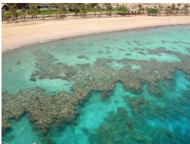
Fringe reef: grows close to a shoreline