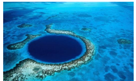
Atoll reef: a ring-shaped reef, formed from a sunken or submerged volcano