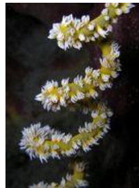
Spiral Wire Coral