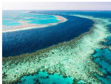
Barrier reef: grows farther from the shoreline