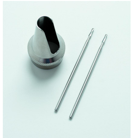
VSP Rabbit and Rodent Dental Kit (SKU# 69500)